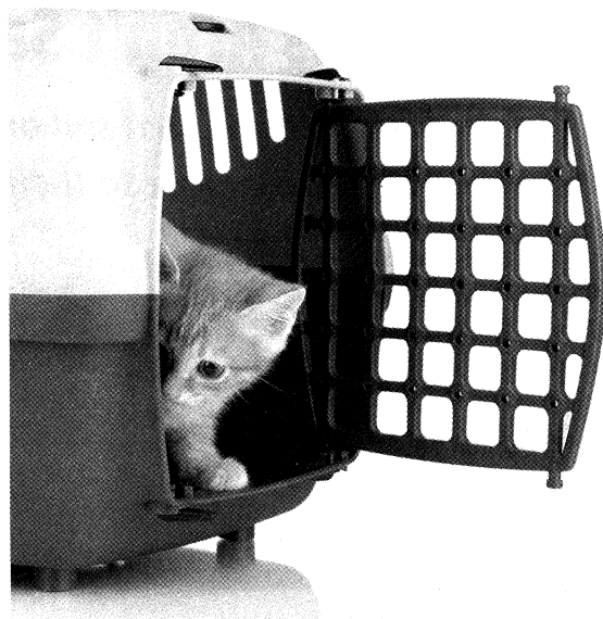
Positive reinforcement can train cats to use the carrier. Put treats inside, and, when your cat enters, use a consistent word so that he associates the word with the act.

3) Accustom him to a crate. Cats are usually cued about an impending vet visit when you pull out the cat carrier. Training him to accept the carrier